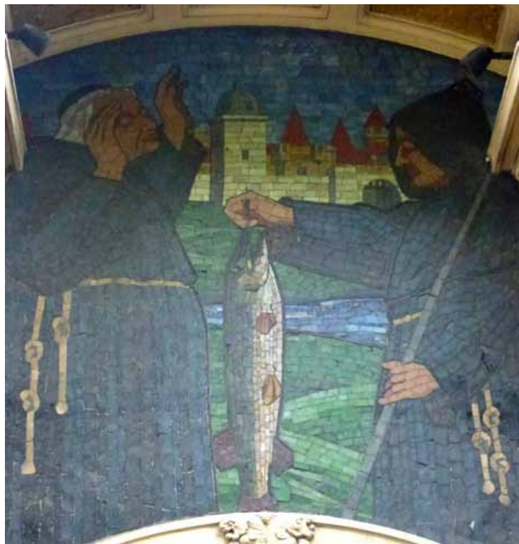
Fishing monks at The Black Friar pub

Discover how the city has been shaped by water. Find evidence of medieval monasteries and Georgian spas. Visit former breweries, holy wells and dangerous dens of vice and criminality brought to life by Charles Dickens.