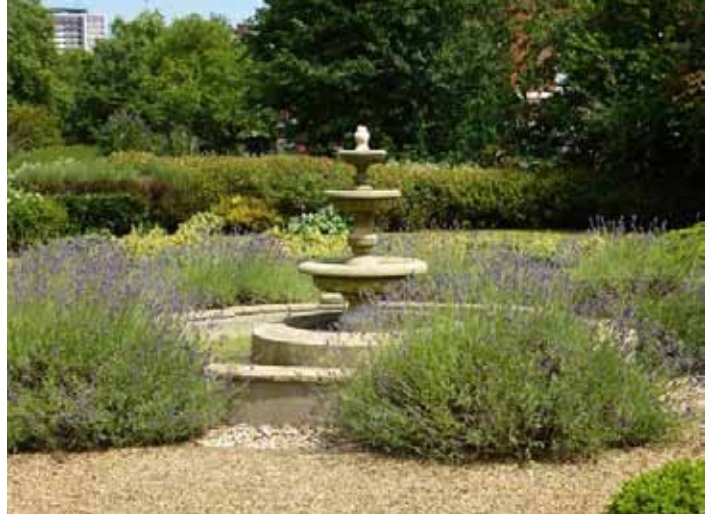
Water fountain at Nautilus House

On this walk from Islington to the Thames at Blackfriars, you will discover how the unseen water under your feet has shaped London, from the natural springs that rose north of the city to the valley of the mighty River Fleet now reduced to a few drops.