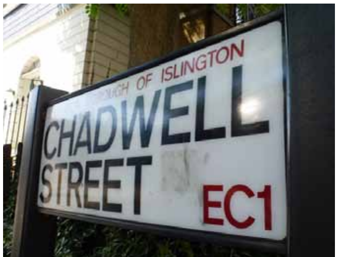
Signs revealing hidden water sources